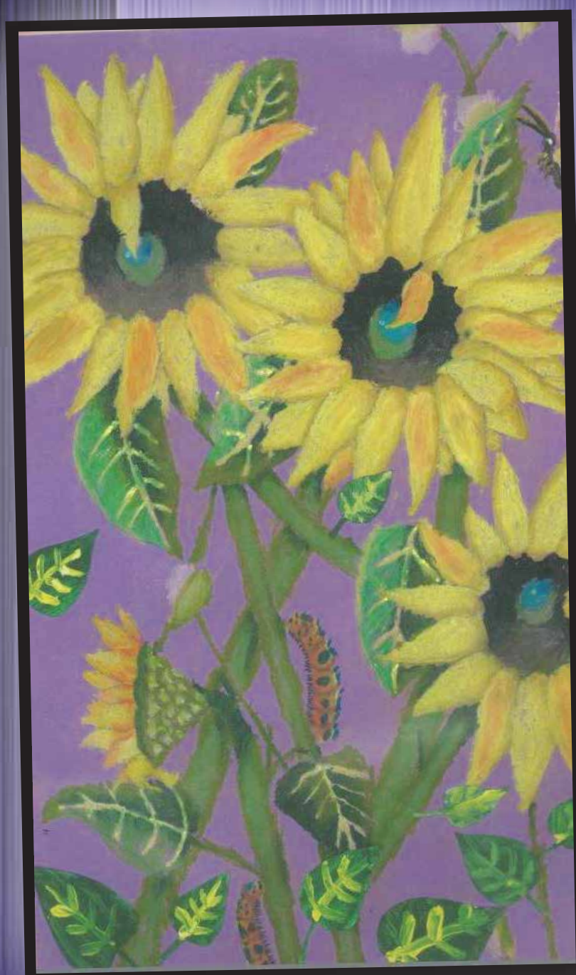
"THE SUNFLOWER GARDEN" - Kathy Xing - age 9