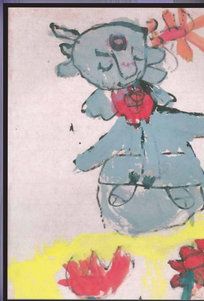
"GENTLE SMILE" - Reietsu Kodera - age 4